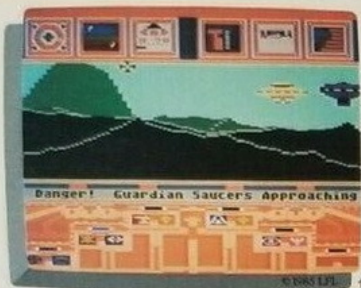
Koronis Rift: A Guardian Saucer™ doesn't like the idea of you looting the Ancient treasure.