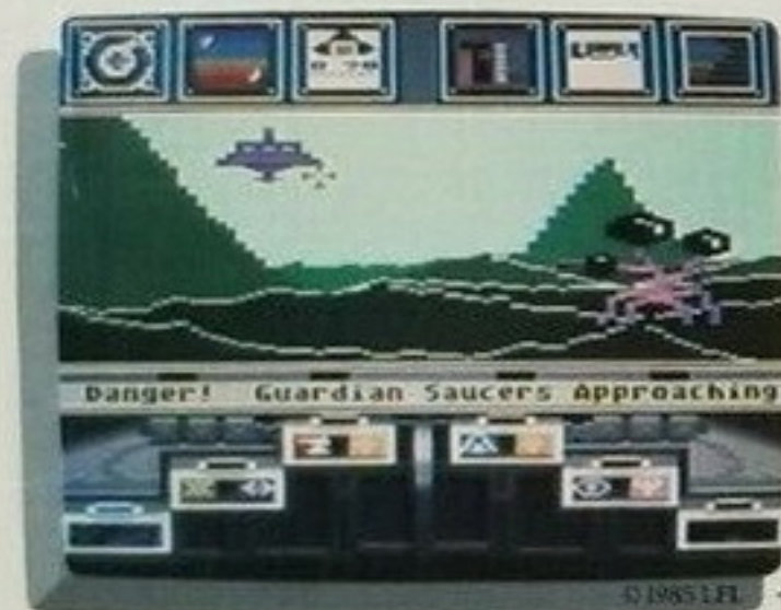
A Hulk: Stuffed with Ancient™ technology and weapons—can you loot it and not be blasted into orbit?