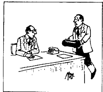
"Industrial sabotage. Someone glued all our disks together."

5 REM CIRCLE DRAWING USING SET 10 REM BY DAVID MCNALLY 15 REM (C) 1992 COLOR COMPUTING 20 CLS 25 V=57.29577951 30 PRINT "INPUT RADIUS OF WIDTH"; : INPUT R1 35 IF R1 < 0 THEN CLS : GOTO 30 40 PRINT "INPUT RADIUS OF HEIGHT"; : INPUT R2 50 R1=INT (R1+.5) : R2=INT (R2/14*9+.5) : REM HELPS KEEP CIRCLE MORE ROUNDED WHEN YOU ENTER WHOLE NUMBERS AND R2 KEEPS SCREEN RATIO 55 IF R2 < 0 THEN CLS : GOTO 40 60 CLS 0 65 FOR T=0 TO 360 70 X=32 : Y=16 75 X1=R1 * COS ((90+T) / V) + X : Y1=- R2 * SIN ((90+T) / V) + Y 80 IF X1 < 0 OR X1 > 64 THEN 90 85 IF Y1 < 0 OR Y1 > 31 THEN 90 ELSE SET (X1, Y1, 1) 90 NEXT T 95 GOTO 95