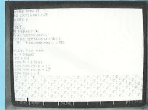
A sample session of source-level debugging.

Microware's TCP/IP implementation conforms to the United States Department of