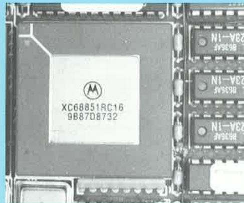
The Motorola 68851 PMMU.

The SPU module uses a system-wide permission mechanism to limit RAM access for user state tasks. Hardware devices supported by Microware's SPU module include the MC68451, MC68851 and custom devices. The SPU software is delivered as a modular addition to OS-9 in source code form and is divided by functions into separate routines that can be modified to support different memory protection devices.