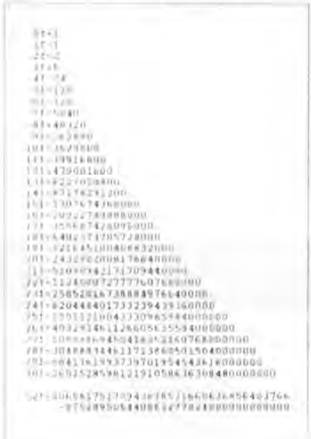
The 2401 digits in factorial 244

the first two features. Proceeding in this way, it is clear that all four would need 4 x 3 x 2 x 1, or 24 attempts. This value is known as 'factorial' 4 and is written 4! - the exclamation mark being the symbol for factorials. A list of some of the lower factorials is given in table 1. Note that 0! is listed as 1. There is no logical reason for this, as 0! is a meaningless quantity, but by convention it is given the value of unity and by so doing many formulae using factorials can be simplified. However, this is a subject which needn't concern us here.