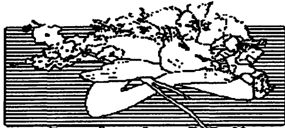
Dreaming of my CoCo?