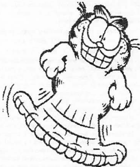
THE CoCo SHUFFLE!

So, as mentioned above, with the magic of the conversion programs I found and time, nothing is out of reach! Clip Art, NO PROBLEM! Saving money, NO PROBLEM! Once again the CoCo earns it's keep. And once again the CoCo shows the PC community that it can keep pace with them without having to spend big PC BUCKS! As CoCo owners, we have a machine we can be proud of. One that allows us to perform complex computer tasks and still be able to buy new shoes for the baby. A machine that can grow with you as your computer needs expand. A machine that has stood the test of time, time and time again. Yes my fellow CoCo friends, we may not have all the software or hardware that the PC enjoys, but what we do have is very good and very affordable (theres that word again!)