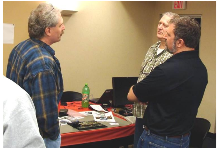
What transistor has that kind of capability?