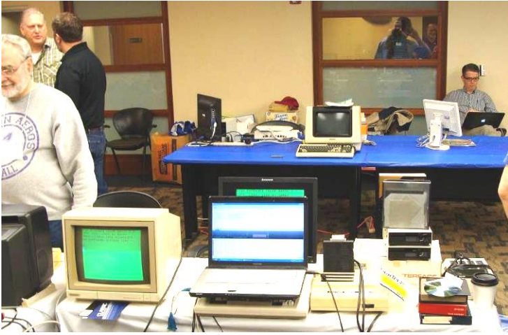
We love the CoCoFEST!