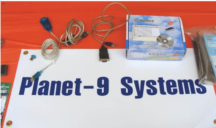
Plan 9 from Outer Space! Well, almost!