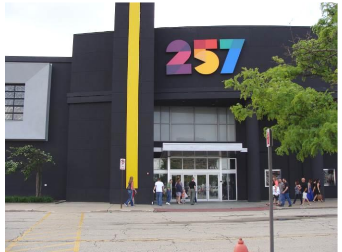
The Level 257 Restaurant at Woodfield Mall.

This is a Pac-Man themed establishment. The original Pac-Man crashes on level 256. (Restaurant, Bar, Bowling and Arcade)