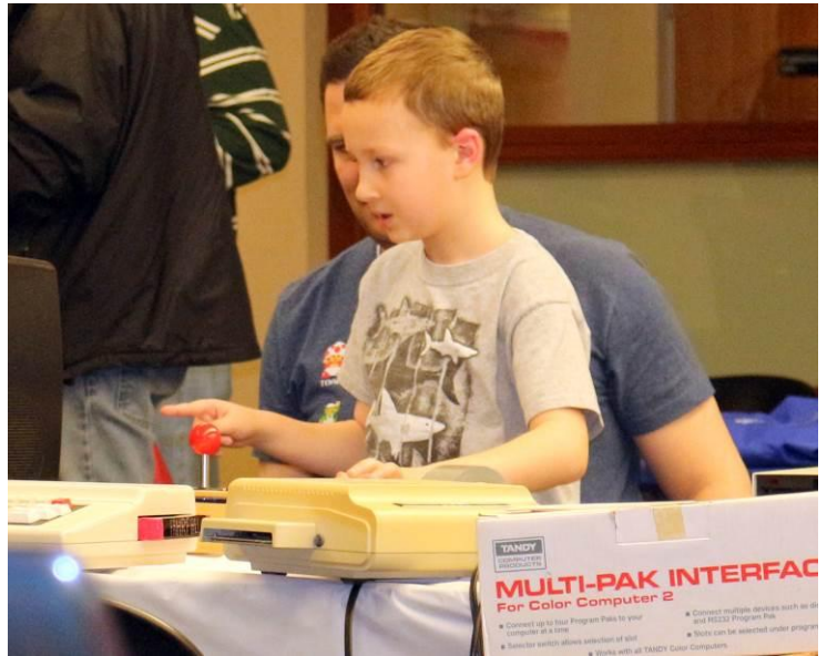
This is a joystick.