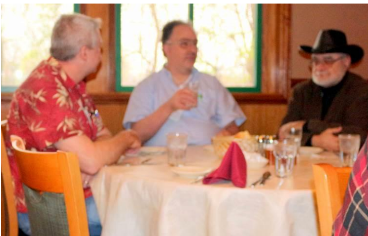
Enjoying dinner at Casey's Restaurant