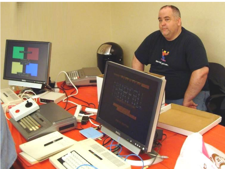
I'm starting a podcast. Have you played FAHRFALL yet?