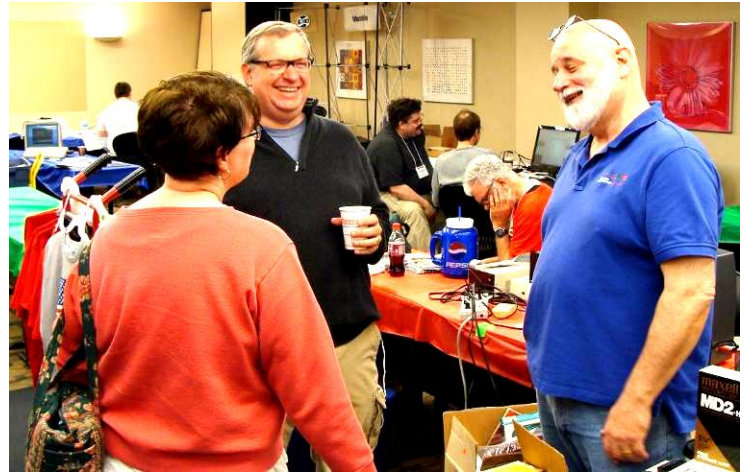
Next year is our 25th Anniversary of the CoCoFEST!

These pictures tell a story of what a great time we had, and how fun 2016 will be.