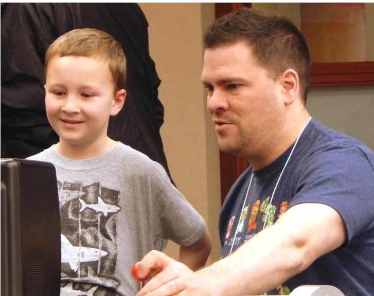
The next generation of CoCo enthusiasts!