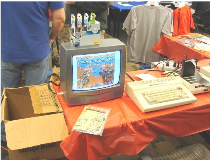
They don't make 'em like this anymore.