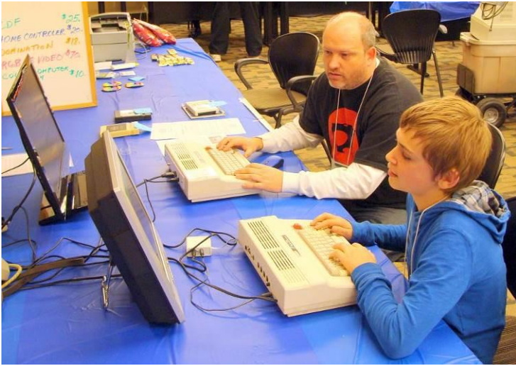
How did you do that? That's really good!