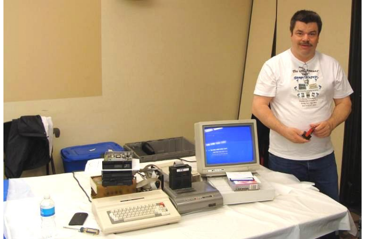
Welcome to my table!