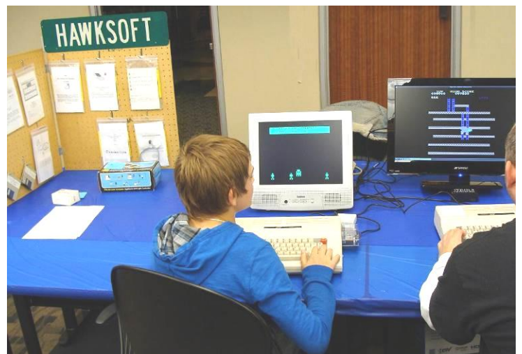
Now there's a REAL game!