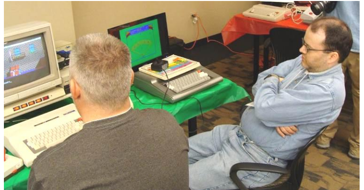
Check this out!