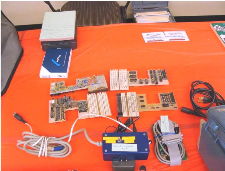
Super Board Mockup (memory expansion and more)