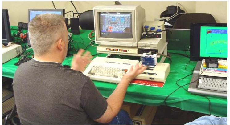
That was a hit! Come on! Work already!