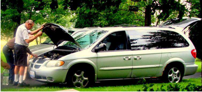
Fixing Tony's van