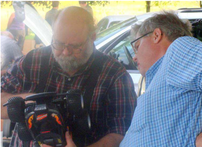
What does this do?