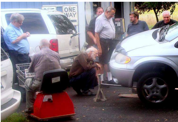
Let's hope this jack holds!