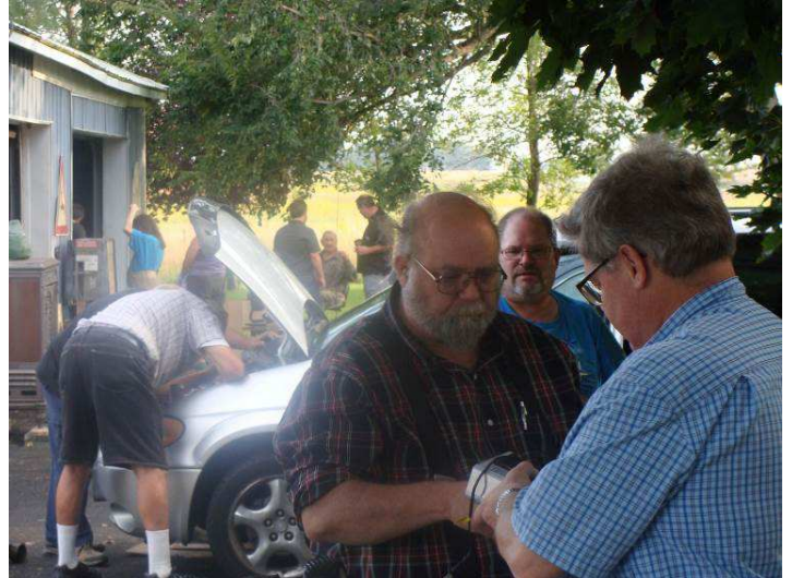
Hold still, I've almost got it...