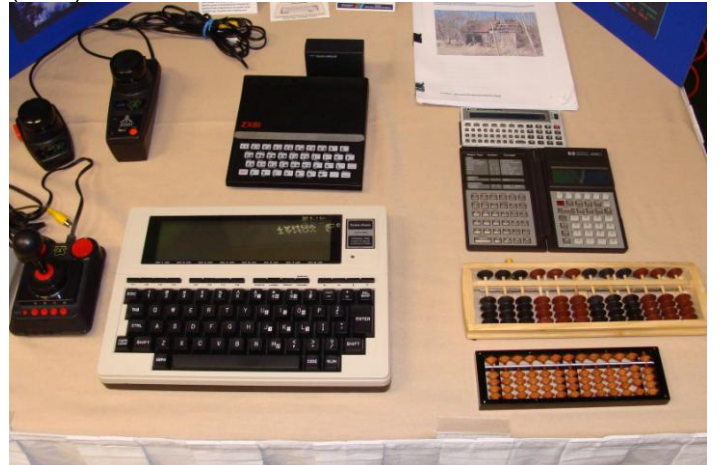
TRS-80 Model 100, and a Sinclair ZX81 w/16K RAM pack. High-viscosity mineral oil must be applied on the connectors of the ZX81 16K RAM pack to prevent crashes and RAM pack burnout. This oil must NEVER be applied to anything rubber like keyboards. It will make anything made of rubber swell, distorting it out of shape.