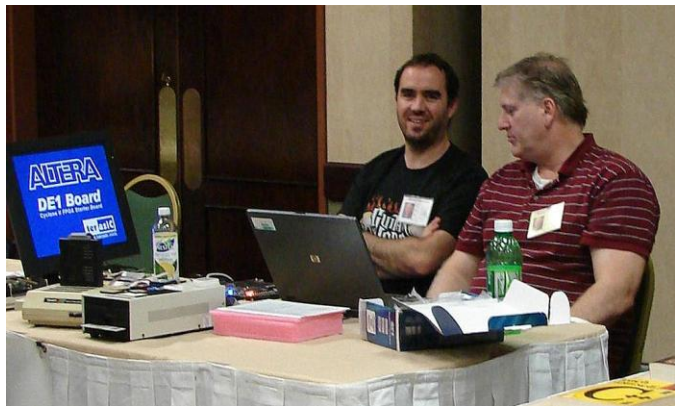
The guys at Cloud-9 had an FPGA board they were playing with, which was set up to mimic a CoCo3 (including support for GIME chip and BASIC and all that). In this video, they explain who is behind the project.

http://www.youtube.com/watch?v=E7982JhI5Kc