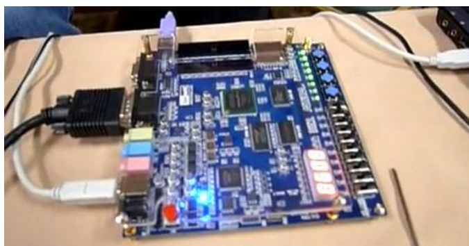
In past years we talked about creating a CoCo4, portable software to run on any platform, as CoCo emulators were not portable enough. Now we have been shown a virtual CoCo 3 running on an Altera D1 board which is smaller and seems to do all of what CoCo3 has done in the past.

http://www.youtube.com/watch?v=E7982JhI5Kc