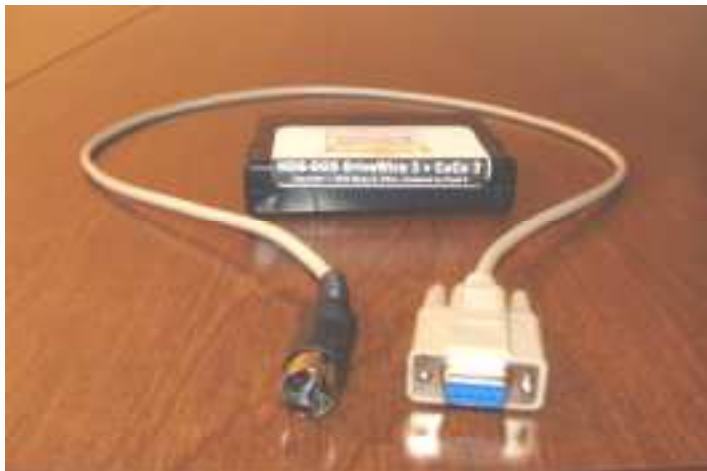
DriveWire ROM Cartridge and Cable