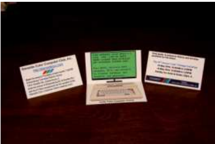
Tent Card Style Business Cards Doubles as Barbie Doll Computer