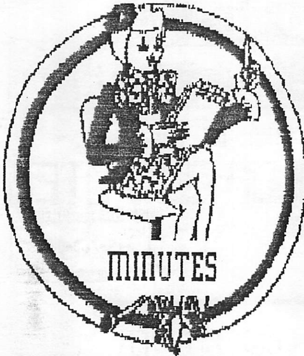
PJCCC Meeting Minutes- March 29 1991