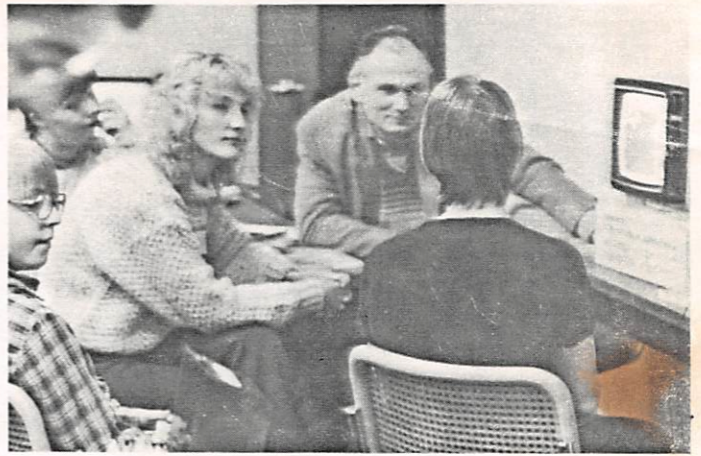
Discussing DESKMATE after the demonstration.