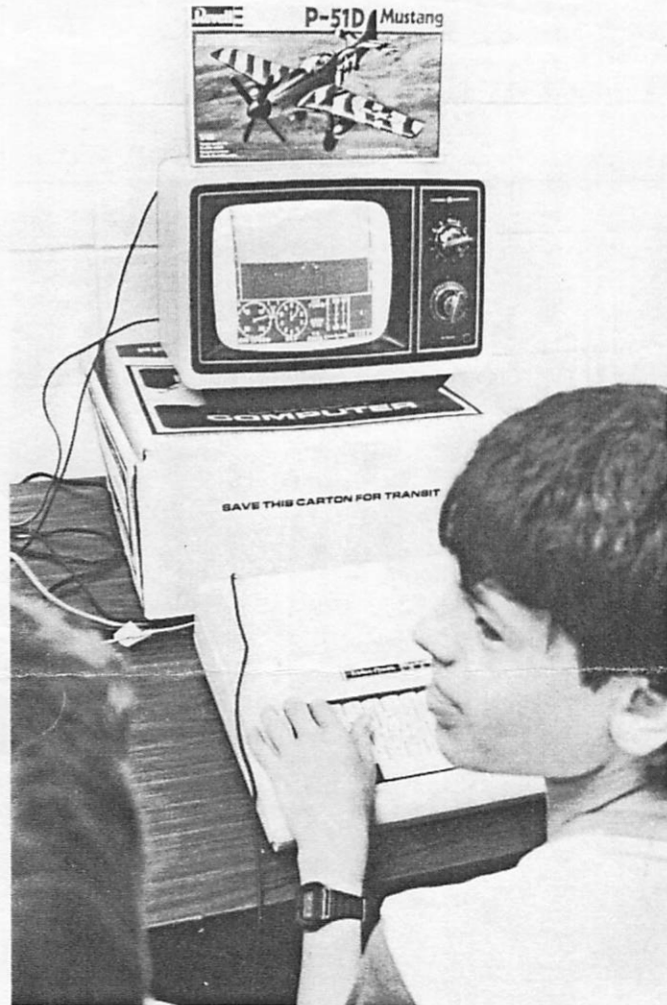
ENJOYING P-51 GAME AT THE LAST MEETING

Roni asked if there were any corrections to the last printed meeting minutes. No corrections were indicated so